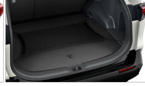
10 | Cargo Net - Horizontal Part No. 99002-53Z00-002