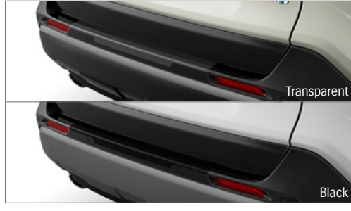
11 | Rear Bumper Protection Film Part No. 99002-53Z00-006 Transparent Part No. 99002-53Z00-017 Black