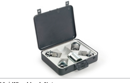
13 | Wheel Lock Nut Part No. 99002-54Z00-036