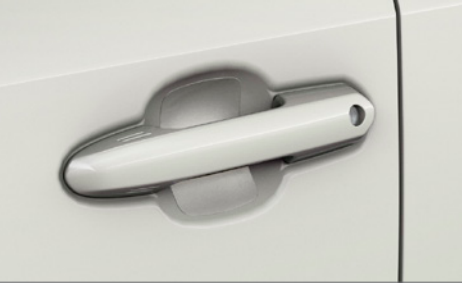
15 | Door Handle Protection Film Transparent, two-piece set. Part No. 99002-54Z00-003