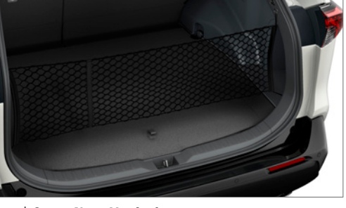
9 | Cargo Net - Vertical Part No. 99002-53Z00-001