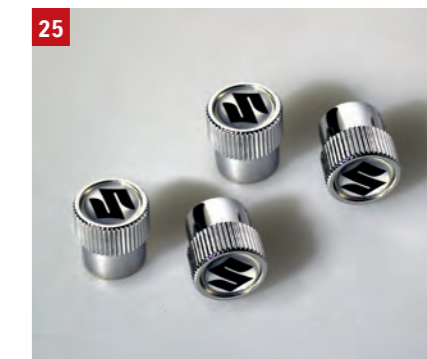
25 | VALVE CAP SET WITH S-LOGO Silver, four-piece set. Part No. 990E0-19069-SET