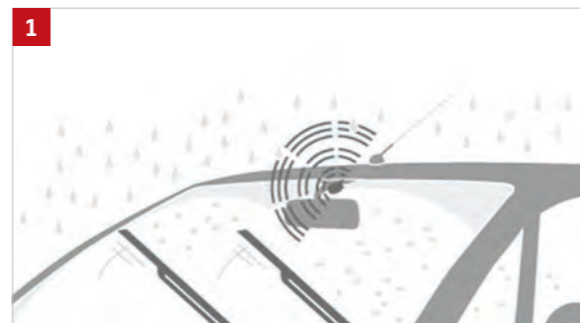
1 | RAIN SENSOR Automatically controls the wind screen wipers in its wiping speed depending on rain condition. Part No. 990E0-65J81-035