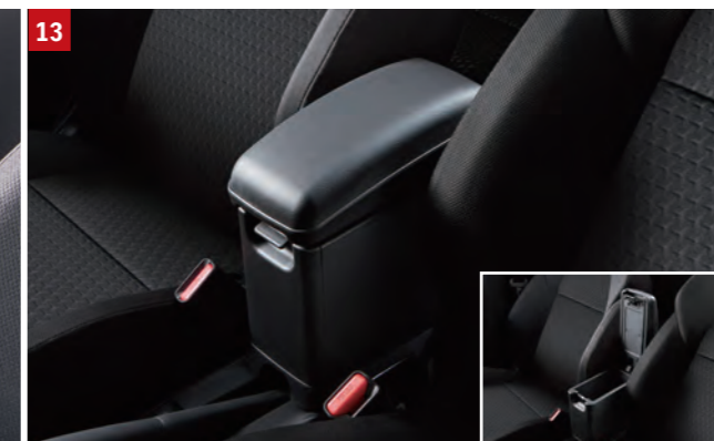
13 | CONSOLE BOX ARMREST With large storage compartment. Part No. 9914G-53R11-000