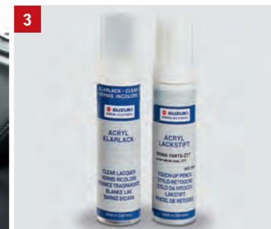
3 | TOUCH-UP PAINT Available in following colours: Burning Red Pearl Metallic (ZWP) Part No. 99000-10415-ZWP Speedy Blue Metallic (ZWG) Part No. 99000-10415-ZWG Pure White Pearl (ZVR) Part No. 99000-10415-ZVR Super Black Pearl (ZMV) Part No. 99000-10415-ZMV Premium Silver Metallic (ZNC) Part No. 99000-10415-ZNC Mineral Gray Metallic (ZMW) Part No. 99000-10415-ZMW Fervent Red (ZNB) Part No. 99000-10315-ZNB Flame Orange Pearl Metallic (ZWD) Part No. 99000-10415-ZWD Rush Yellow Metallic (ZYG) Part No. 9925D-B0100-ZYK