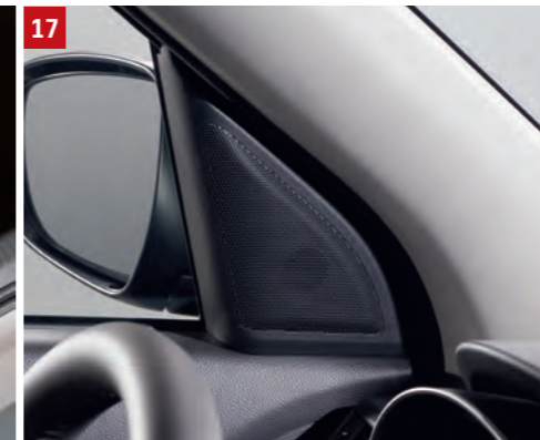
17 | TWEETER SET Package includes : • Tweeter • Harness set • Tweeter covers (L/R) Part No. 990E0-53R18-000