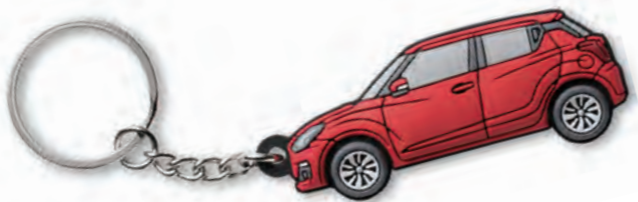
2 | RUBBER KEY HOLDER, SWIFT H25mm × W113mm Part No. 99000-990M1-K04