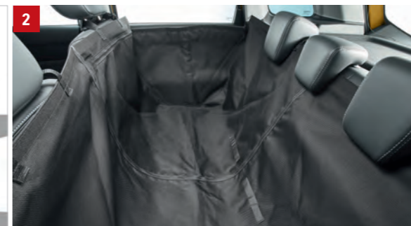
2 | REAR SEAT PROTECTIVE COVER For the rear seat upholstery. Part No. 990E0-79J44-000