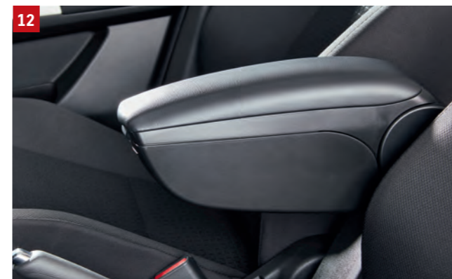
12 | CENTER ARMREST For more comfort, with storage department, adjustable in height and length, black. Part No. 990E0-53R35-000