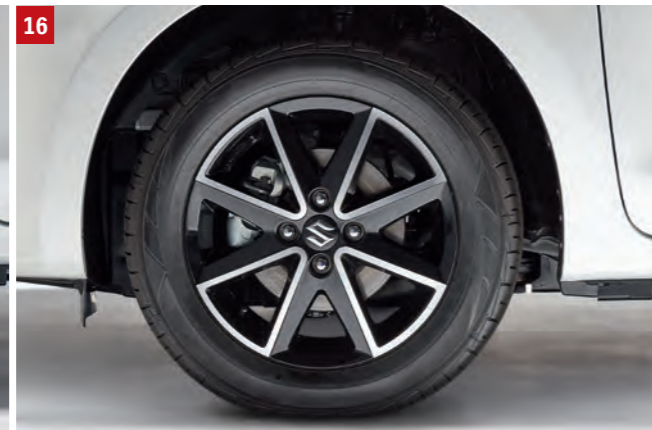
16 | ALLOY WHEEL "SAMBA" Black polished, 5Jx15" alloy wheel for 175/65R15 tires, centre cap with Suzuki logo. ECE R124 and JWL approval. Part No. 43210-60PS0-OSP