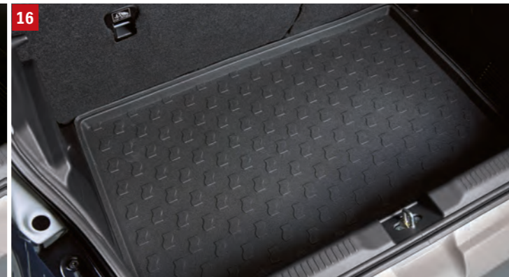
16 | CARGO TRAY 1 Waterproof with raised edges. Part No. 990E0-53R15-000