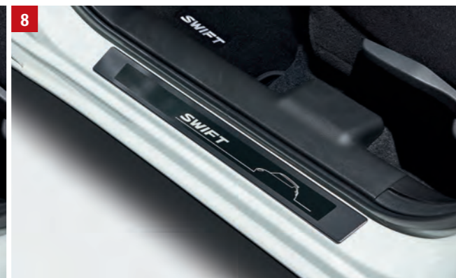
8 | SIDE SILL SCUFF Black including inlay printed Swift logo, four-piece set. Part No. 990E0-53R60-001