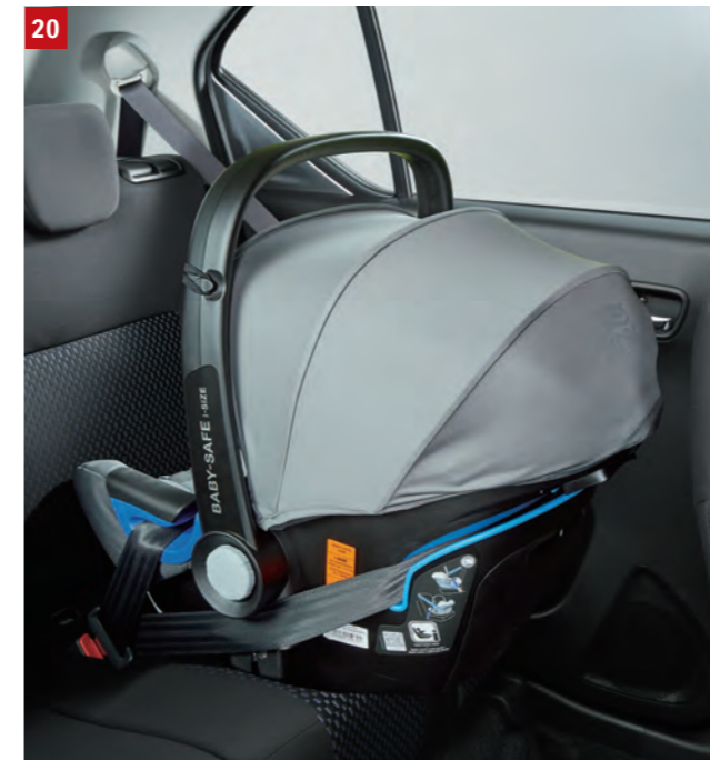
20 | CHILD SEAT "BABY-SAFE I-SIZE" Baby-Safe i-Size is an infant carrier that conforms to the new car seat regulation ECE R 129. The seat provides safety and comfort for newborns up to 15 months, adjusting and protecting your child as they develop and grow to 83 cm in height. Part No. 88501-77R00-000