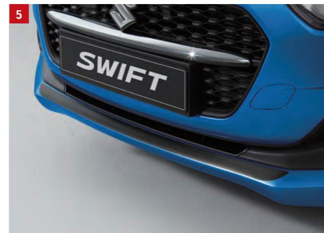
5 | LIP DECAL FRONT BUMPER One-piece, carbon design. Part No. 990E0-53R97-000