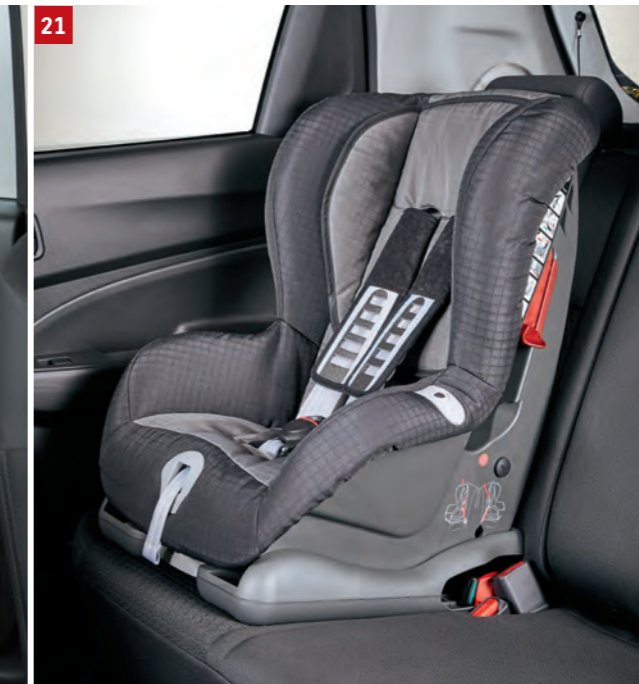
21 | CHILD SEAT "DUO PLUS" Child seat of group 1 for kids of 9 to 18 kg of weight or approx. 9 months to 4 years of age. This seat is tested and approved to the current Child Seat Safety Standard ECE R 44/04. Installation in the car by the ISOFIX brackets, the seat features optimum side impact protection, unique Forward Tilt Control, singlehanded adjustment to change from the upright position to the reclined and sleeping positions. 5-point harness system with one-pull adjustment, shoulder pads reduce the load in the neck/head area. The comfortable fabric cover is removable for washing. The seat can also be fitted in cars without the ISOFIX system by using the vehicle's 3-point seat belt. Part No. 990E0-59J56-000