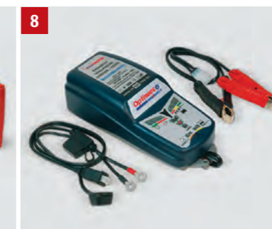
8 | BATTERY CHARGER Maintainer and tester for 12V batteries, optimizes battery power and life. Part No. 990E0-OPTIM-CAR