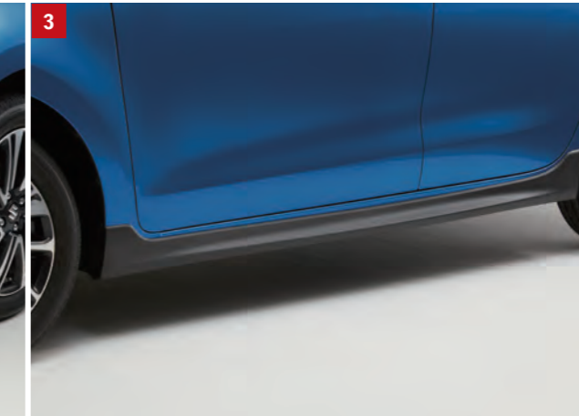
3 | SIDE UNDER SPOILER Carbon design, for right and left hand side. Part No. 99112-53R01-000