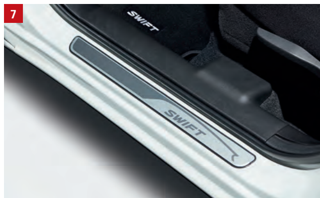
7 | SIDE SILL SCUFF Anodized aluminium satin surface, four-piece set, with polished Swift logo. Part No. 990E0-53R60-000