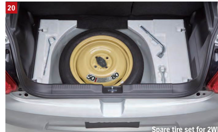
20 | SPARA TIRE KIT for 2WD 1 Includes spare tire kit, fixation kit, jack and jack bracket kit. Part No. 990E0-STSW2-001