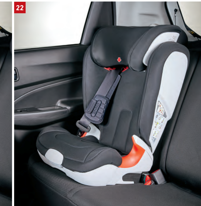
22 | CHILD SEAT "KIDFIX XP" The KIDFIX XP is a new child seat of group 2 and 3 and offers safety reassurance for parents and comfort for the older child from approximately 15 to 36 kg. This high back booster seat's innovative XP-PAD gives advanced frontal protection. This seat is tested and approved to the current Child Seat Safety Standard ECE R 44/04. Installation in the car by the ISOFIX brackets, the seat features optimum side impact protection. Its SecureGuard (patent pending) ensures optimal lap belt positioning. And its deep softly padded side wings offer cocooning safety for growing heads and neck from 4 to 12 years. Part No. 990E0-59J25-002