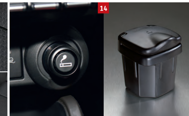
14 | SMOKER'S KIT Contains Cigarette Lighter (p/n 39400-59J00-000) and ashtray (p/n 89810-86G10-5PK). Part No. 990E0-68P00-SMK