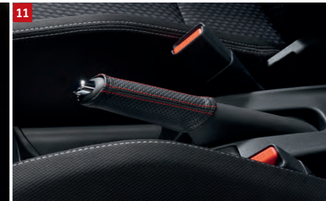
11 | PARKING BRAKE HANDLE COVER Leather, with red stitching. Part No. 990E0-53R17-000