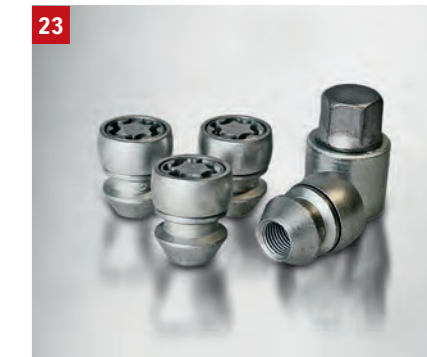
23 | WHEEL LOCKS "SICUSTAR" Four-piece set, with Thatcham approval. Part No. 990E0-59J47-000