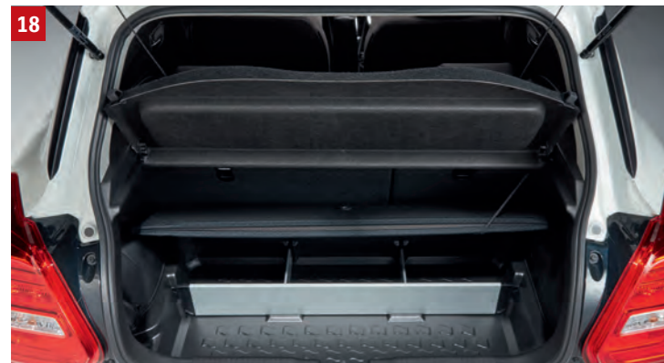
18 | CARGO ORGANIZER 1 Tray including variable aluminium dividers and top cover. Part No. 990E0-53R21-000