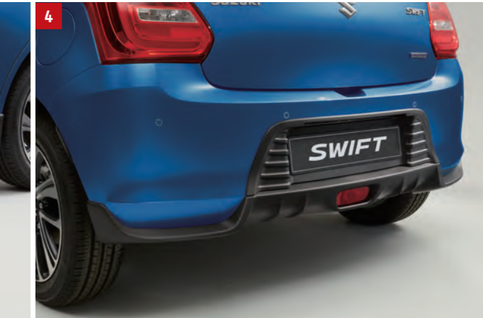
4 | REAR UNDER SPOILER Diffuser style, carbon design. Part No. 990E0-53R47-000