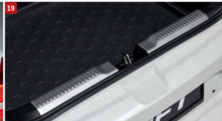
19 | INNER LOADING EDGE PROTECTION Aluminium brushed design, made of thermoplastic, protects your inner loading edge from scratches when loading and unloading. Part No. 990E0-53R52-000