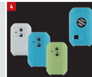
4 | "GLOW IN THE DARK" SILICON KEY COVER Glow in the dark by absorbed light energy and protects your car key from scratches. Available in following colours: WHITE Part No. 99000-79N12-377 BLUE Part No. 99000-79N12-378 LIME GREEN Part No. 99000-79N12-379