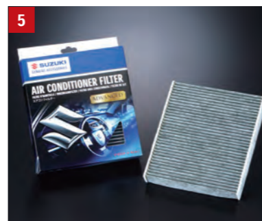
5 | A/C DEODORANT FILTER Filters dust, pollen, sand, mites, unpleasant odours from outside and inside the car and other air impurities including the PM2.5 capturing effect which keeps the air in a cabin cleaner than the air filtered by standard A/C filter. Part No. 99250-53R01-000