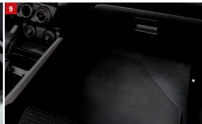
9 | FLOOR ILLUMINATION Optical white LED illumination, set for front and rear footwells, left and right side. Part No. 99213-53R01-000