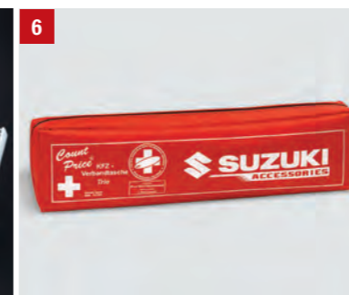
6 | FIRST AID KIT Including warning triangle and a safety vest, complies with DIN 13164. Part No. 990E0-61M79-000