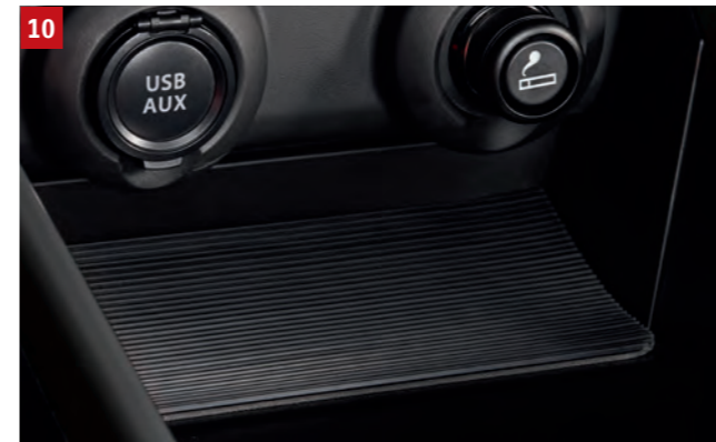
10 | ANTI SLIP INLAY For the centre console to prevent content rattling or moving around. Part No. 990E0-53R20-000