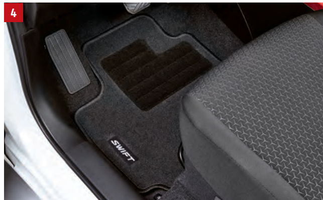
4 | FLOOR MAT SET "ECO" 1 Anthracite needle felt carpets with silver stitched logo and black binding, four-piece set, for M/T and A/T. Part No. 75901-52RE1-000 LHD Part No. 75901-52RD1-000 RHD (no image)