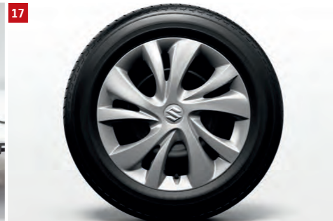
17 | 15-INCH WHEEL COVER Silver, for 15" steel wheel, one piece. Part No. 43250-52R00-ZH1