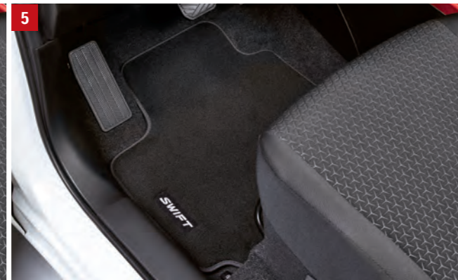
5 | FLOOR MAT SET "DLX" 1 Anthracite velour carpets with silver stitched logo and Nubuk binding, four-piece set, for M/T and A/T. Part No. 75901-52RG1-000 LHD Part No. 75901-52RF1-000 RHD (no image)