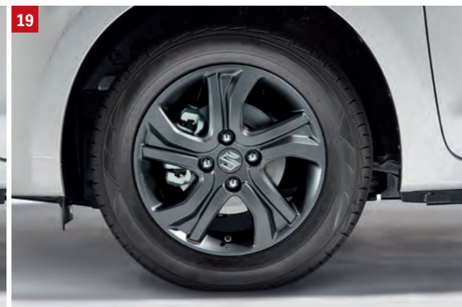
19 | ALLOY WHEEL "COSMIC" Mistral anthracite matte painted, 5Jx15" alloy wheel for 175/65R15 tires, centre cap with Suzuki logo. ECE R124 and JWL approval. Part No. 43210-52RU0-000