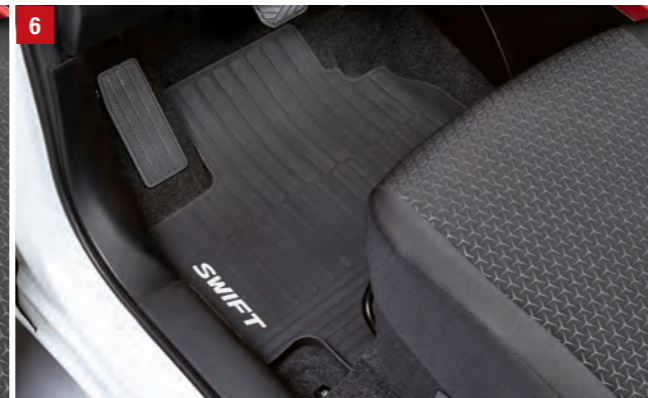
6 | RUBBER FLOOR MAT SET 1 Raised edge to help keeping the footwell clean, four-piece set, for M/T and A/T. Part No. 75901-52R11-000 LHD Part No. 75901-52R01-000 RHD (no image)