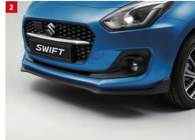
2 | FRONT UNDER SPOILER Diffuser style, carbon design. Part No. 990E0-53R44-000