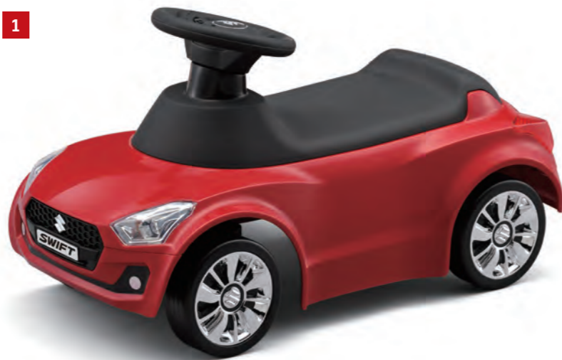
1 | KID'S CAR, SWIFT For 18 months - 36 months Children Allowable Weight: 7kg - 23kg H346mm × W302mm × L628mm Part No. 99000-79NN0-000