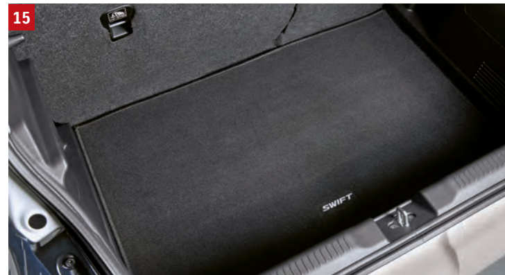
15 | CARGO MAT "ECO" Anthracite needle felt carpet with silver stitched logo and black binding. Part No. 990E0-53R40-000