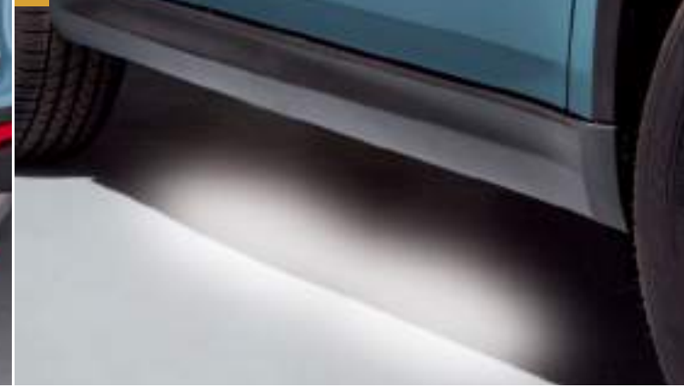
3 | LED Coming Home Function Upon opening front doors, the area below the front doors of the vehicle is illuminated to assist passengers to find their way.