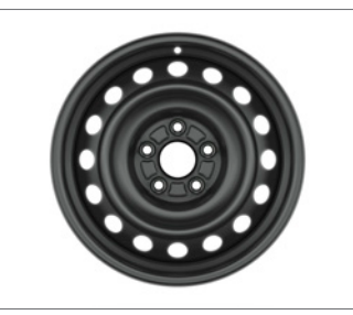
1 | Winter Rim 16" Steel, w/o center wheel cap. Part No. 99002-54Z00-023

Nut for Winter Rim 16" Exclusive for winter rim, NOT compatible