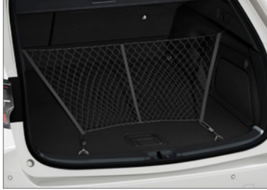
3 | Cargo Net - Vertical For complete installation, both Cargo Net Vertical and Fitting kit for Cargo Net - Vertical (x2) are required. Part No. 99002-54Z00-002