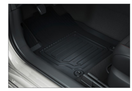
1 | Rubber Floor Mat for LHD With SWACE logo, four-piece set. Part No. 99002-54Z00-039