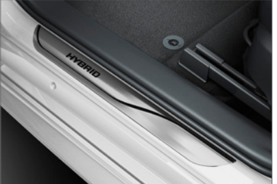
2 | Side Sill Scuff With "HYBRID" logo. Brushed aluminum, four-piece set. Part No. 99002-54Z00-020