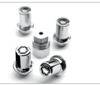
2 | Wheel Lock Nut Part No. 99002-54Z00-036

TPMS kit Four-piece set with fitting parts Part No. 99002-54Z00-034